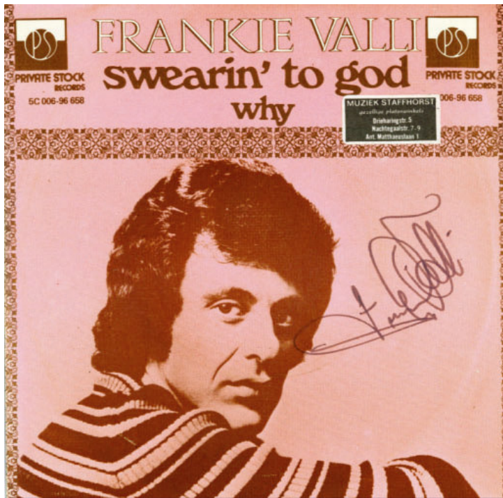
Dutch autographed pic sleeve

"Valli continued to perform the track in concert throughout the latter half of 1974 ." recalls Rex Woodard.