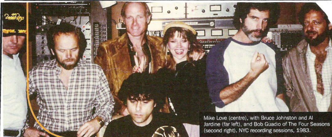
Mike Love (centre), with Bruce Johnston and Al Jardine (far left), and Bob Guadio of The Four Seasons (second right), NYC recording sessions, 1983.

Photo UK Record Collector No. 341 10/07 Article "Mike Love – Anti-Hero or Villain?"