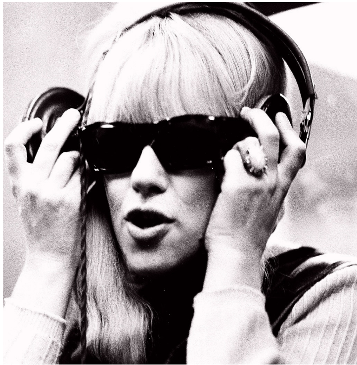
Ellie Greenwich in a Bob Crewe recording session late 1966